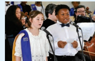
Two Blakeney students sing the song “Change the World” at the 40th Anniversary Spring Concert, Sunday, May 7, 2023.