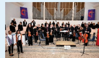
The ACOG, Aiken Civic Orchestra and soloists pause for a photo after performing “Let There Be Peace on Earth” at the 40th Anniversary Christmas Concert, Sunday, December 11, 2022.